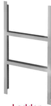
Ladder BAKED ENAMEL