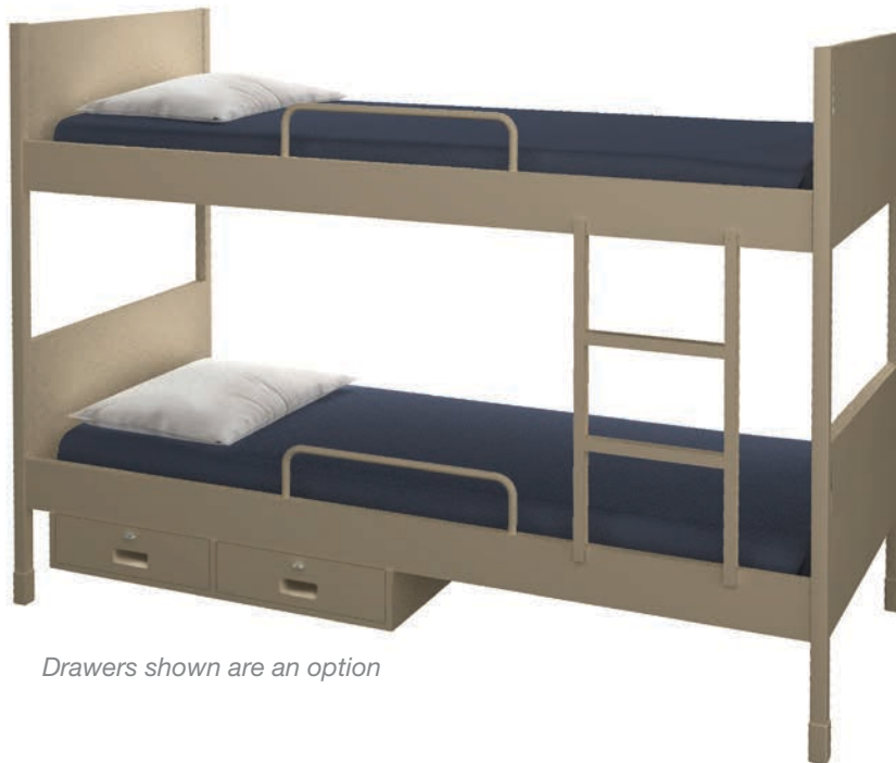
Drawers shown are an option

DeanSteel Manufacturing Company 931 S. Flores Street San Antonio, TX 78204