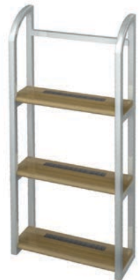
Ladder OAK TREAD BAKED ENAMEL