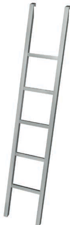
Tall Ladder BAKED ENAMEL