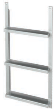
Ladder STAINLESS STEEL